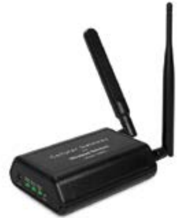
Wireless cellular Gateway receives signal that door was hit