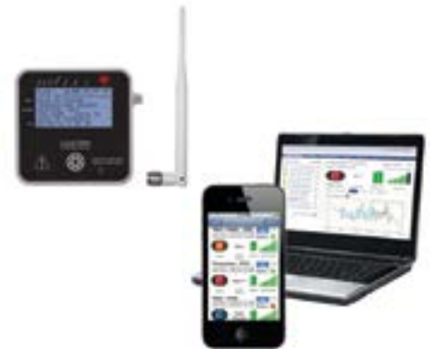
Real-time alerts via text, phone and email