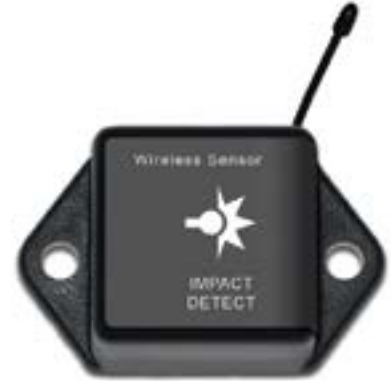
Wireless impact detector is mounted to bottom bar

For applications within close proximity to the door, an optional local alert LED display box is available which sounds an audible alert and displays critical details about the door that was hit, including door number, time of impact and more. This is ideal for locations that have maintenance crews on-site and available to respond immediately.