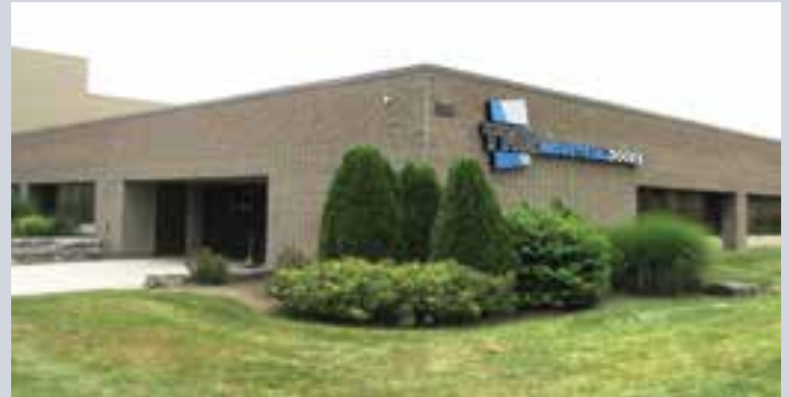
TNR Doors, Barrie, Ontario, Canada High Performance Doors