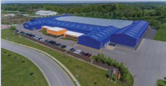
Hörmann Burgettstown, PA

fire stations or food processing, we have the door you're looking for. The Hörmann product line has a door for any application, from one manufacturer.