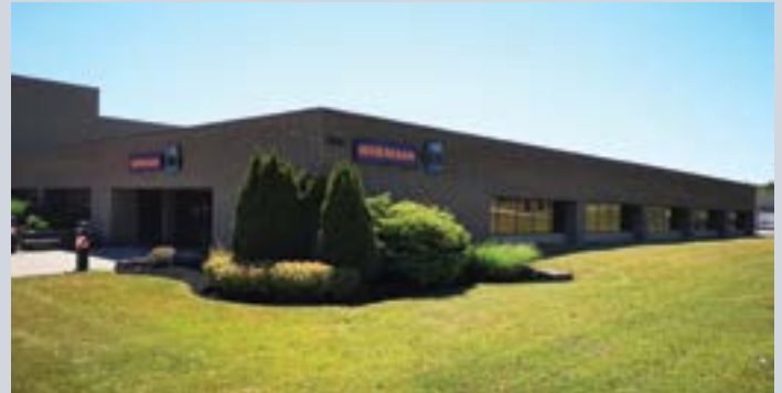
Hörmann Barrie, Ontario, Canada