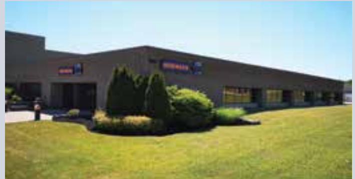
Hörmann TNR Doors, Barrie, Ontario, Canada High Performance Doors