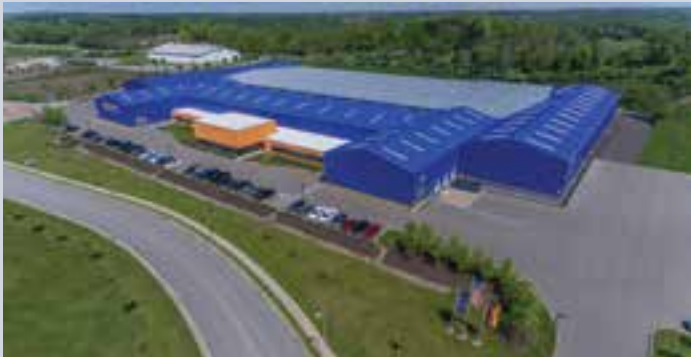
Hörmann High Performance Doors, Burgettstown, PA High Performance Doors

fire stations or food processing, we have the door you're looking for. The Hörmann product line has a door for any application, from one manufacturer.