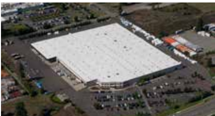
Puyallup, WA - Sectional Doors