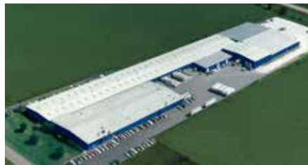
Montgomery, IL - Sectional Doors