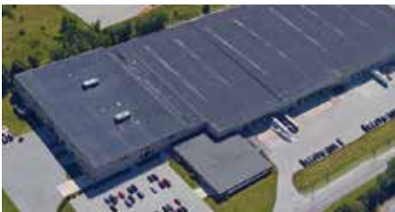
Barrie, ON (CAN) - High Performance Doors