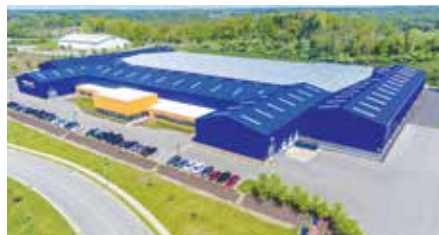
Burgettstown, PA - High Performance Doors

As one of the world's leading manufacturers of doors we're committed to providing the best quality, value, and selection. Whether residential, commercial or industrial, we have the door you're looking for. Each Hörmann product gives you the perfect array of benefits and options to satisfy your customers.