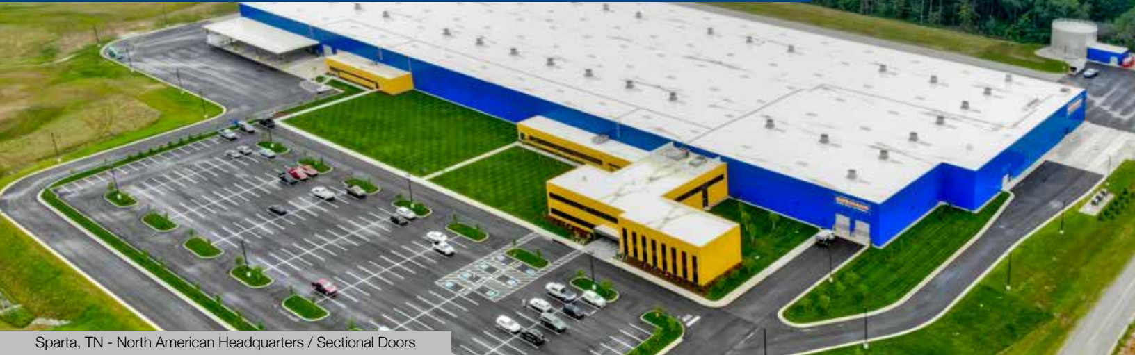
Sparta, TN - North American Headquarters / Sectional Doors