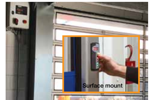
Perform control box functions from ground level

More and more installations require that the door control box is installed out of the reach of passersby or completely away from the door in a central location. For these types of applications, our remote keypad is the ideal option. The actual door control box is remotely installed and all control functions are performed at the door through a compact, 3” x 5½” keypad. Initial installation set-up, opening and closing, as well as service and troubleshooting are all done through the remote keypad. The remote keypad may be installed as a flush or surface mount on any surface including drywall, steel or wood.