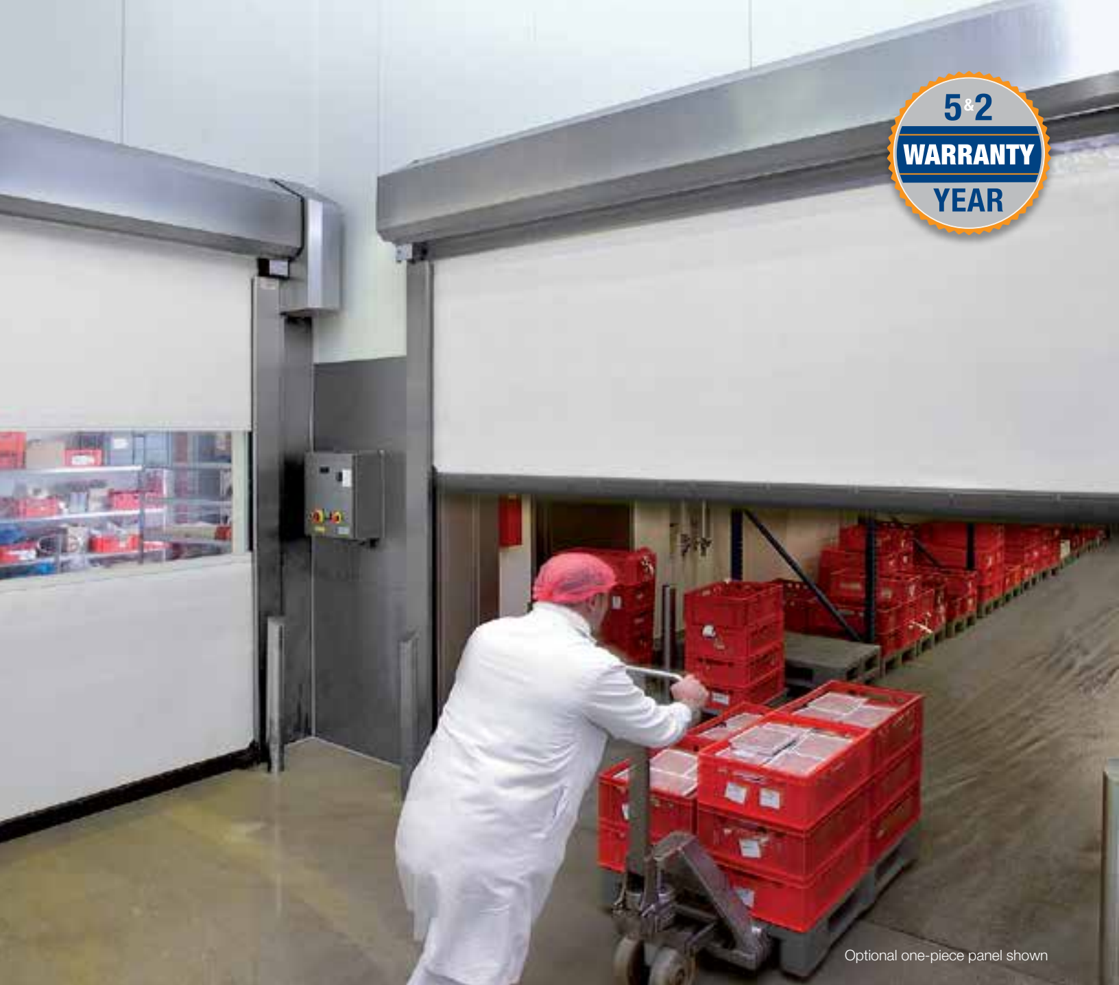
Optional one-piece panel shown