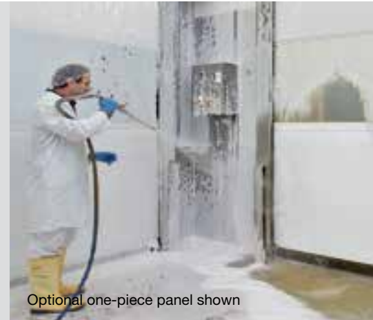
Optional one-piece panel shown