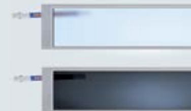
Tinted vision options: Obscured White or Smoke Gray

Fast operating speeds reduce heat and air conditioning loss and promote security