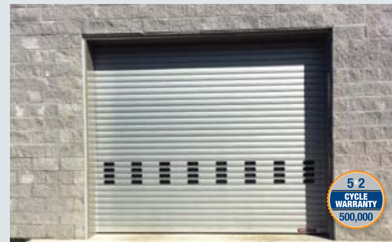
Fast operating speeds control energy costs and prevent unwanted entry

Optional colors are available on both the Speed-Guardian™ and Steel Ranger™ models (Any RAL color). A motion-presence detector is recommended for door activation and is strategically positioned and programmed to detect if a vehicle is parked with the pathway of the door opening. This, in conjunction with the built-in guide track light curtain, provide an invisible barrier of protection for pedestrians and vehicles.