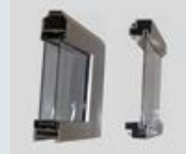
(Left) Our double-pane slat (Right) Their single-pane slat