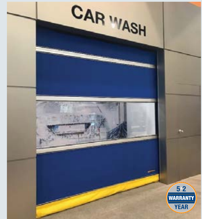
High-speed efficiency and breakaway at a lower cost point

See product-specific brochures for additional information on models. Technical specifications are available on model Product Data Sheets.