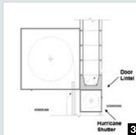
Hurricane Shutter Under Lintel Mount

Because adhering to hurricane rating specifications for new construction and renovation projects can be challenging, we offer three mounting configurations for the tandem hurricane shutter on our Class 5 double door solution: exterior mount, under the doorway lintel, or above the doorway lintel. It's important to note that when mounting the tandem hurricane shutter under the doorway header, 10 to 12 inches of headroom is sacrificed. Depending on the height of the traffic moving through the opening, additional height may need to be added to the door opening.