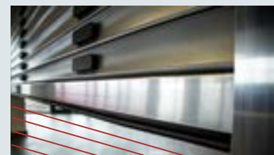
Light curtain (standard on SG, SR and SM models) built into guide tracks prevents door contact with pedestrians and vehicles