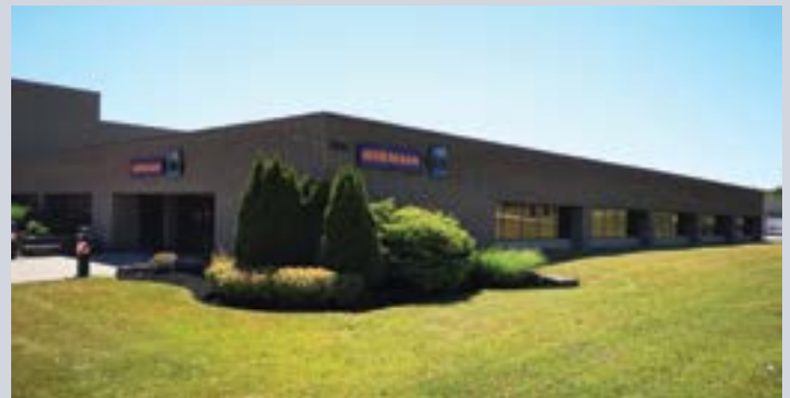
Hörmann Barrie, Ontario, Canada