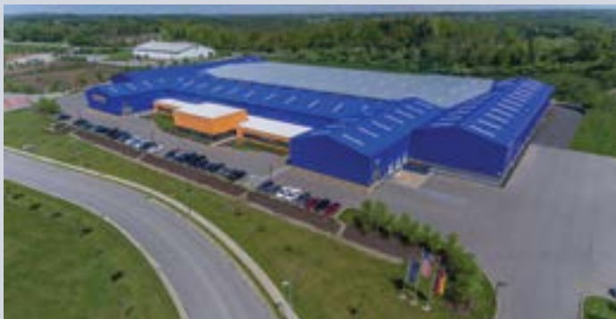
Hörmann Burgettstown, PA

fire stations or food processing, we have the door you're looking for. The Hörmann product line has a door for any application, from one manufacturer.