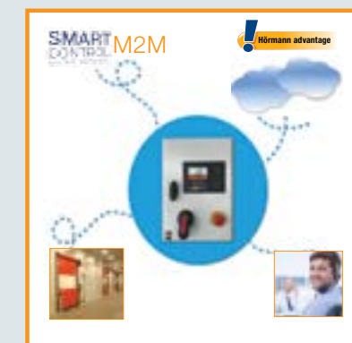
Remote diagnostics for fast technical support anytime, anywhere