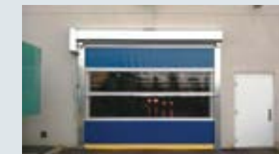
Options such as roll / motor cover and gearbox heater for exterior mounting