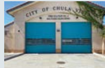
Custom RAL colors match any building color scheme