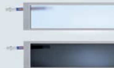
Tinted vision options: Obscured White or Smoke Gray

Fast operating speeds for the quickest possible exit