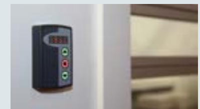
Remote keypad performs control box functions from ground level