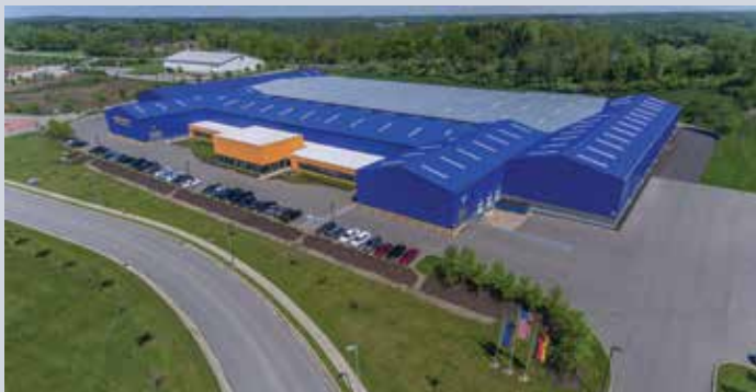
Hörmann Burgettstown, PA

fire stations or food processing, we have the door you're looking for. The Hörmann product line has a door for any application, from one manufacturer.