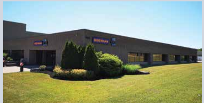
Hörmann Barrie, Ontario, Canada