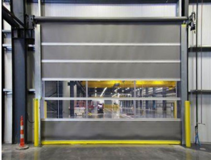
Pictured: The Speed-Master® 2600 L available in grey.