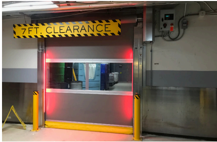
The Speed-Master® High speed line of doors provide advanced controls and fast opening speeds.