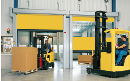
Speed-Commander™ 1400 SEL 19 Food-Master high speed flexible door in yellow with roll tube and motor cover.