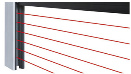
Light Curtain Safety Device pictured, standard with Hörmann Speed-Commander™ doors.

The Hörmann Smart Start™ NXT Control Panel now updated with SmarControl M2M remote diagnostic functionality enables users with real-time data about their High-Performance Door. Track event history, maintenance schedules, and resolve common codes at your fingertips.